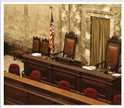
International Finance Discussion Papers: External Governance and Debt Agency Costs of Family Firms